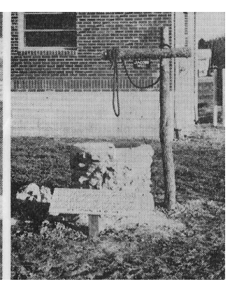
Above are four of the latest markers on Jerusalem Acres. They are from left to right: